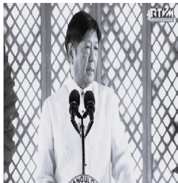
President Ferdinand R. Marcos Jr. during the ceremonial signing of the Republic Act No. 12023 or the Value Added Tax (VAT) on Digital Services Act at Malacañang Palace on 2 October 2024

"We are thrilled with the inclusion of the creative industries in this new law. This is a significant win for our creative industries that work tirelessly to enrich world-class Filipino creative content on digital platforms," said DTI Competitiveness and Innovation Group Undersecretary